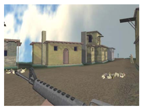
Figure 2. Screenshot from prototype ISAT implementation in 91W10 TC3 Trainer.

The existing TC3 proof-of-concept implementation highlights "Tactical Field Care," which means that the medic is out of direct fire, but threat has not been defeated (as opposed to "Care Under Fire," where the medic is under direct fire). Currently, TC3 development is focusing on situations where the trainee provides care under fire. After an initial introduction, the trainee is placed in a simulated environment with a firstperson point of view holding his rifle. The trainee may then survey the situation and move around the environment, a 100 ft. radius circle of terrain representing a courtyard in an Afghani village. Trainee actions include slinging the rifle, manipulating casualties, and accessing items in the medical bag to assess casualties, prioritize treatment, and treat injuries.