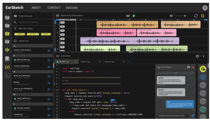
Figure 3: Instant messages between collaborators through the chat window.

The study procedure consisted of asking the group to create a live coding session. The group was asked to work on a shared Python script of EarSketch using their own individual laptops. The group was expected to write code by turn-taking and to communicate between the team members (e.g., taking decisions) via a chat